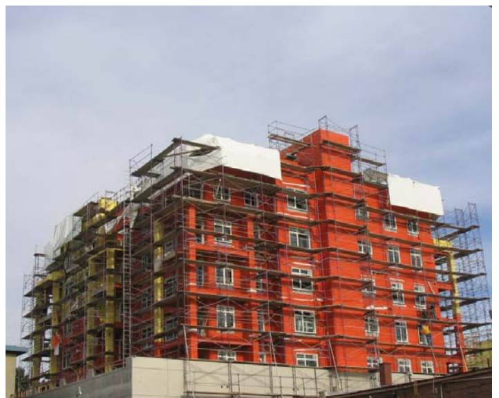
WrapShield Membrane in Orange During Construction

Other factors in selecting WrapShield is its durability and weather resistive properties as well as its suitability for high rise buildings.