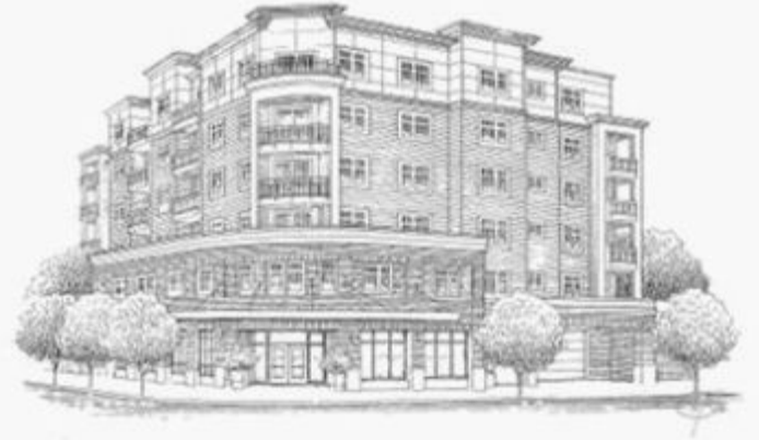
Architectural Rendering of Completed Condominiums